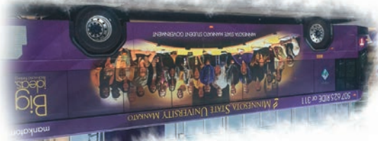
STUDENT INVOLVEMENT Student Government