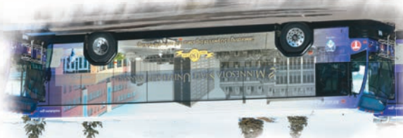
RESIDENTIAL LIFE Daniel Buck Hall (oldest), Gage Towers & Margaret R. Preska Residence Community (newest)