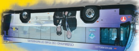
CITY PARTNERSHIP City's Airport & Minnesota State Mankato's Aviation Program & Commercial Pilot Alumni