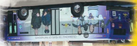
CITY PARTNERSHIP Verizon Wireless Center & Hockey Training Center City Public Safety & Minnesota State Mankato Security