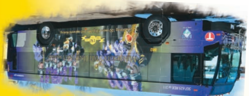
ARTS & CULTURE Music's Maverick Machine