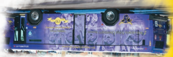
ATHLETICS 2017 NCAA Division II National Champions Women's Softball