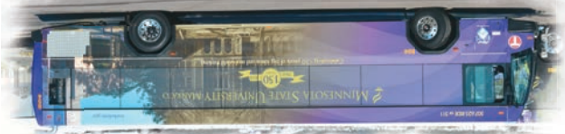
HERITAGE Old Main, Bell Tower & Alumni Arch