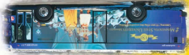
ARTS & CULTURE The Odyssey - 2011 National Winner Kennedy Center American College Theatre Festival