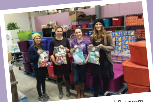
Service Week: BackPack Food Program