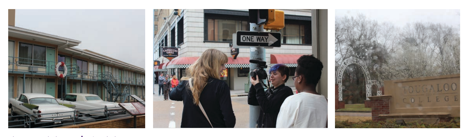
Anne Moody's Mississippi