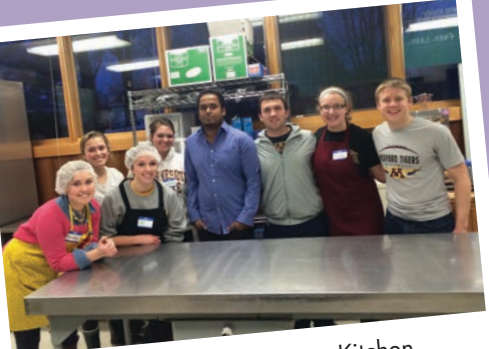
Service week: Campus Kitchen