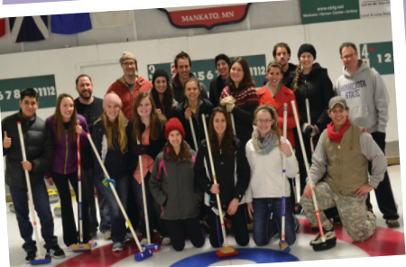
Honors Event: Curling Challenge