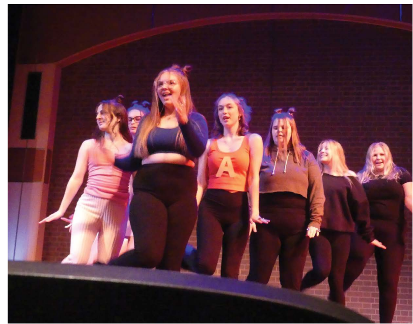
Members of Alpha Sigma Alpha compete in the 2025 Greek Week Lip Sync Battle