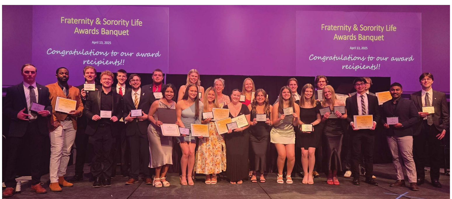
Award recipients were recognized at the April 13 FSL Awards Banquet