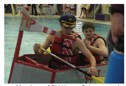
Members of Phi Kappa Psi compete in the Boat Regatta, in their boat made of nothing but cardboard and duct tape.